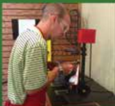
Tour Level Fitting

Our on-site Performance Center features state-of-the-art equipment from a variety of manufacturers for a Tour level fitting. The PGA Professionals in our Performance Center are: Certified club fitters for Callaway®, PING®, TaylorMade® and Titleist®, Certified KBS® Shafts fitters, Certified FlightScope® professionals, U.S. Kids Golf and EyeLine Golf Certified Instructors.