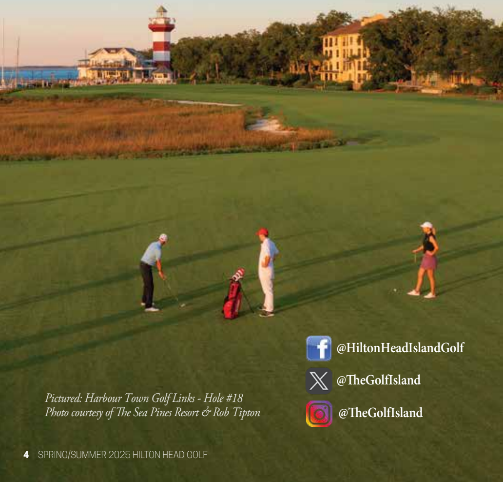
Pictured: Harbour Town Golf Links - Hole #18