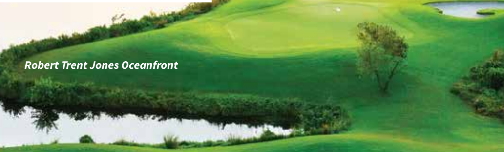
Robert Trent Jones Oceanfront