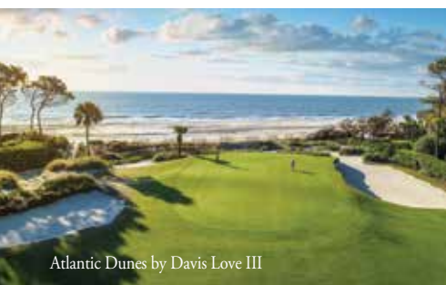
Atlantic Dunes by Davis Love III

Hilton Head Island is shaped like a foot. The Sea Pines Resort, home of the famed Harbour Town Golf Links and two other storied courses, is located at the “toe”, or the south end of the Island. The late Pete Dye’s masterpiece at Harbour Town remains a lasting monument to Southern coastal golf and a bucket-list course for any aficionado. Atlantic Dunes by Davis Love III is a complete redesign of the Resort’s historic Ocean Course by the popular five-time Heritage champion. Not to be outdone, the Resort’s Heron Point by Pete Dye features his classic hallmarks – risk-reward holes, fairways that move toward and away from hazards and his ubiquitous mounding and swales framing target areas.