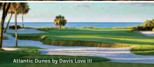
Atlantic Dunes by Davis Love III

*Rate is based on quadruple occupancy in a two-bedroom deluxe villa and does not include taxes and fees.