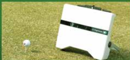
FlightScope® X2 3-D Doppler Radar Launch Monitor