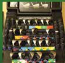
Ping® Color Coding